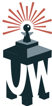
LOGO ON LEFT, TYPE ON RIGHT UNITED WORKERS STACKED/CENTERED